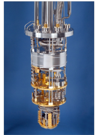
Wet DR 500 stage for UHV applications

© Copyright 2022 FormFactor, Inc. All rights reserved. FormFactor and the FormFactor logo are trademarks of FormFactor, Inc. All other trademarks are the property of their respective owners.