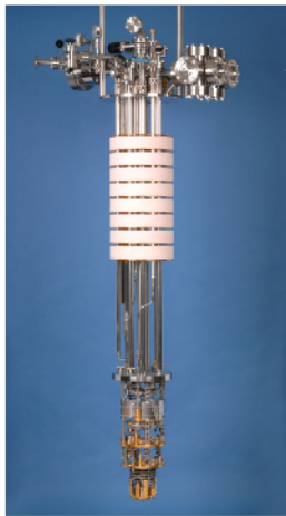
Wet DR 500-TL insert for STM