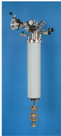
Wet DR 250 insert