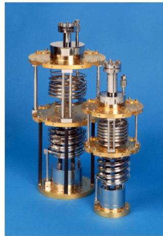
Side by side comparison of Wet DR 250 and Wet DR 500 dilution refrigerator stages