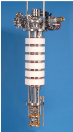
Wet DR 50-TL insert for STM

*Ultra-high vacuum (UHV) sample space available upon request.