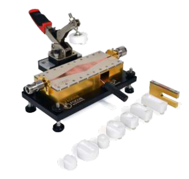
Power Test Jig

Since load pull is a lengthy test procedure, on the same device, we opted for a manual, instead of an automatic probe station (LPPS).