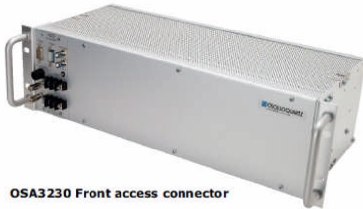
OSA3230 Front access connector

The OSA 3230 Cesium Clock offers a unique set of operational features and performance, including greatly enhanced and easy integration into industrial, professional time and frequency host systems. With its long life cesium tube, the OSA3230 will meet the requirements where G.811 performances are needed over a long period of time.