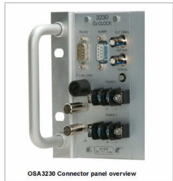
OSA3230 Connector panel overview