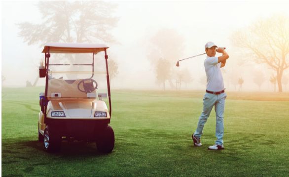
Golf caddies and trolleys