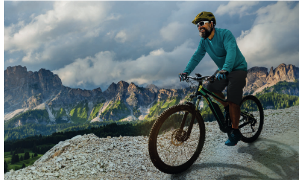
E-Bikes and Pedelecs