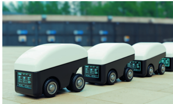
Last Mile Logistics