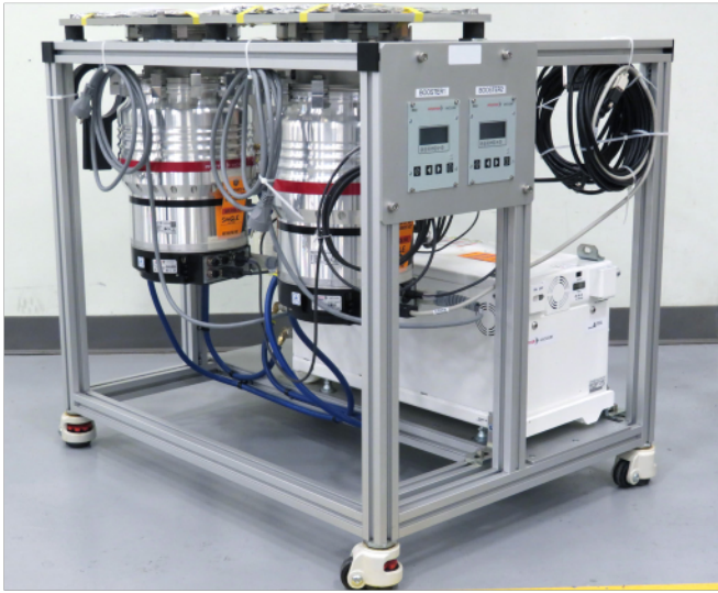
JDry-600 Pump Cart