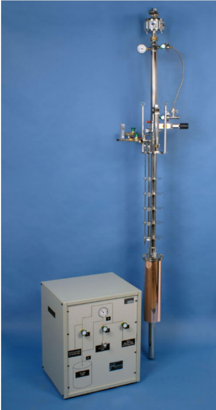
Model HE-3-TLSL Helium-3 Cryostat with Gas Handling System