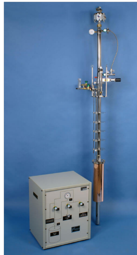
Model HE-3-TLSL Helium-3 Cryostat with Gas Handling System