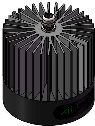
FOR REFERENCE ONLY

PROPRIETARY AND CONFIDENTIAL THESE DRAWINGS AND SPECIFICATIONS ARE THE EXCLUSIVE PROPERTIES OF ADVANCED ILLUMINATION INCORPORATED ISSUED IN STRICT CONFIDENCE AND SHALL NOT, WITHOUT THE PRIOR WRITTEN PERMISSION OF ADVANCED ILLUMINATION INC BE REPRODUCED, COPIED OR USED FOR ANY PURPOSE WHATSOEVER EXCEPT THE MANUFACTURE OF ARTICLES FOR ADVANCED ILLUMINATION INC