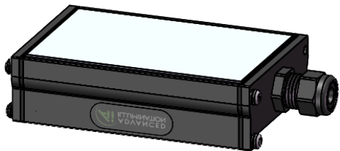
FOR REFERENCE ONLY

PROPRIETARY AND CONFIDENTIAL THESE DRAWINGS AND SPECIFICATIONS ARE THE EXCLUSIVE PROPERTIES OF ADVANCED ILLUMINATION INCORPORATED ISSUED IN STRICT CONFIDENCE AND SHALL NOT, WITHOUT THE PRIOR WRITTEN PERMISSION OF ADVANCED ILLUMINATION INC BE REPRODUCED, COPIED OR USED FOR ANY PURPOSE WHATSOEVER EXCEPT FOR THE MANUFACTURE OF ARTICLES FOR ADVANCED ILLUMINATION INC