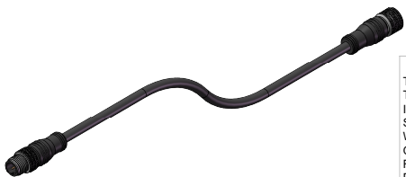
FOR REFERENCE ONLY

PROPRIETARY AND CONFIDENTIAL THESE DRAWINGS AND SPECIFICATIONS ARE THE EXCLUSIVE PROPERTIES OF ADVANCED ILLUMINATION INCORPORATED ISSUED IN STRICT CONFIDENCE AND SHALL NOT, WITHOUT THE PRIOR WRITTEN PERMISSION OF ADVANCED ILLUMINATION INC BE REPRODUCED, COPIED OR USED FOR ANY PURPOSE WHATSOEVER EXCEPT THE MANUFACTURE OF ARTICLES FOR ADVANCED ILLUMINATION INC