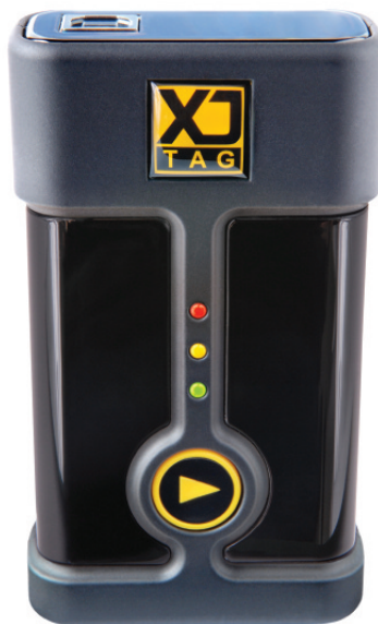
Available in black and yellow.*

The XJLink2 has variable signal termination, so it can handle boards both with and without signal termination. The advanced auto-skew control enables you to get the maximum frequency out of your JTAG chain and cable while the configurable voltage levels allow you to connect directly to most TAPs.