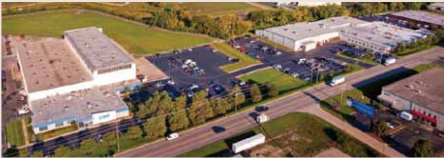
CSZ has two manufacturing facilities in Cincinnati, OH with world-wide sales and service.