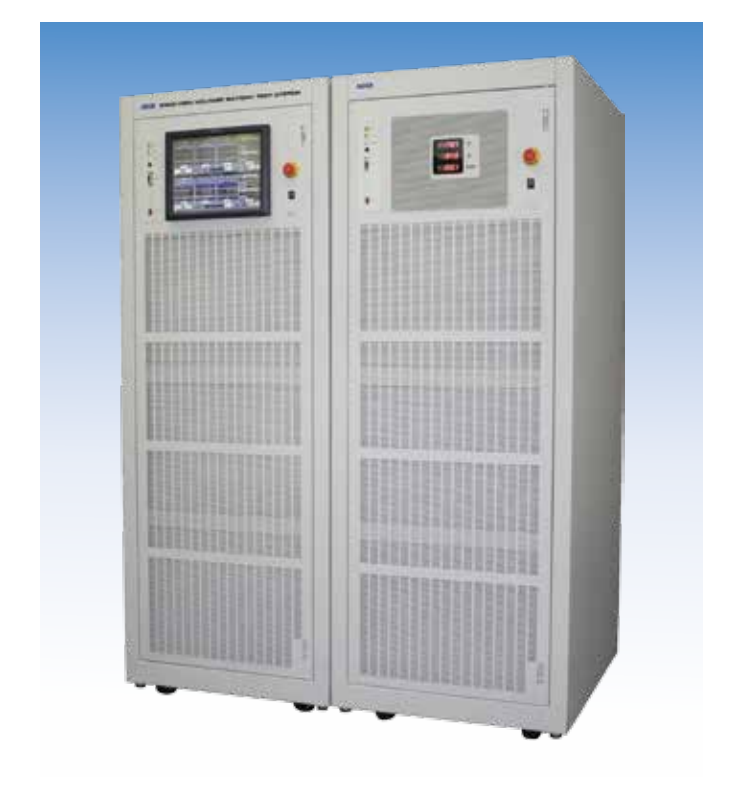
Model 9300 200kW Test System

Maximum voltage and current for a given kW rating is the typical place to start when evaluating power cyclers. The 9300 optimizes these two parameters through two ranges, one to provide up to 1200V and the other to provide up to 333A within a single 100kW cabinet (Fig. 1). More current and power is available through additional 100kW cabinets, which can be run synchronously in parallel up to 1.2MW/4000A. The exceptionally wide operating envelope combined with the ability to add additional 100kW cabinets, allows the test engineer to choose a power level that yields cost efficient testing of todays' products without risk of being caught without enough current or power to test future products. One can always add more cabinets in the field.