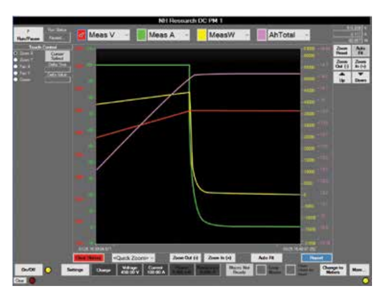
Figure 2 - Chart Recorder

A wide range of precision measurement information is provided by the I-MS/S digitization of analog measurement signals within each cabinet. An example is the simultaneous measurements of voltage, current, amp-hours and watt-hours that are continuously available. The digitizer data may be accessed or downloaded to provide high-resolution, synchronized samples of voltage and current for advanced measurements such as battery condition. Additional measurement input channels are available through third-party data acquisition hardware that runs under Enerchron®. The resulting comprehensive measurement information minimizes or even eliminates the need for additional measurement instruments required for the test system (Fig. 2).