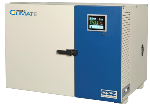
Figure 1 - Reach-In Chamber

To get the best value, here's what you need to know before you buy your next test chamber.