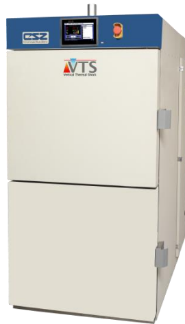
Figure 2 – Thermal Shock Chamber

Thermal shock chambers come in many different sizes and configurations (Figure 2). These chambers can move the product from one temperature condition to another within a matter of seconds. Moving from a high temperature to a low temperature quickly thermally shocks and stresses the product. By performing these tests, the manufacturer can check the reliability of its process.