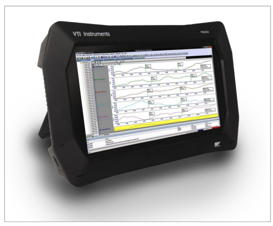
PMX04 PORTABLE 4-SLOT PXIE 'TABLET'

The PMX04 Portable 4-Slot PXIe `Tablet' installed with EMX-4250's further improved ease of use and portability, as it provided the test engineers with a mobile test system that they could carry to any point near the aircraft and quickly set up and acquire data on the spot.