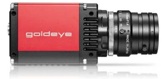
// Goldeye – Excellent in infrared