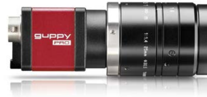
// Guppy PRO – Concentrated simplicity

Ultra-compact affordable cameras for simple plug-and-play integration into commonly used image-processing systems. They are particularly suitable for classic inspection tasks in the industrial segment and, due to their compact dimensions, are also favourites for interactive multimedia applications.