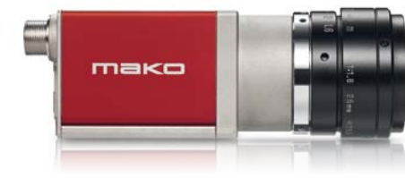
// Mako – Small and robust