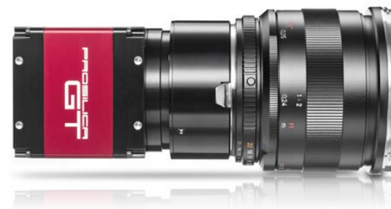
// Prosilica GT/GT Large – Strong performance

High-performance cameras with special features that exceed industrial standards. With high resolution, extended operating temperature ranges, or infrared sensitivity, they are designed and built to fulfill the most demanding requirements in industrial image processing or special applications such as traffic monitoring and scientific imaging.