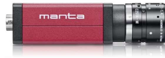
// Manta – Freedom of choice

High-performance industrial cameras with an extensive range of sensor options, modular construction, and integrated image optimization functions (smart features). Their versatility and outstanding value make them ideal for even the most demanding inspection and monitoring tasks.