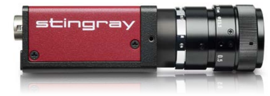
// Stingray – Smart modularity