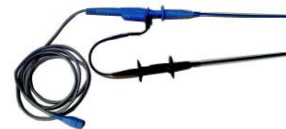
The photograph attaches 701948 to 700929.