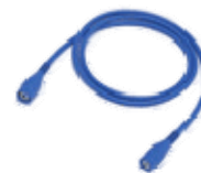
Safety BNC Cable 701902/701903