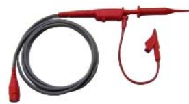
NEW 100:1 Probe (for Isolated BNC Input) 701947