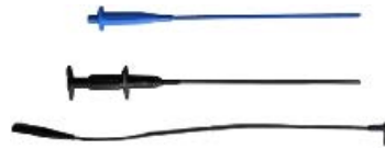
NEW Plug on clip 701948