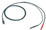
BNC Safety adapter Lead 701901

*1:CAT II, Probe alone. *2:CAT I, Probe alone. *3: Input Capacitance: Capacitance at the tip of the probe *4:Compensation Range: Compensation Range for the input capacitance of the oscilloscope *5:Please check the specifications of the connection module.